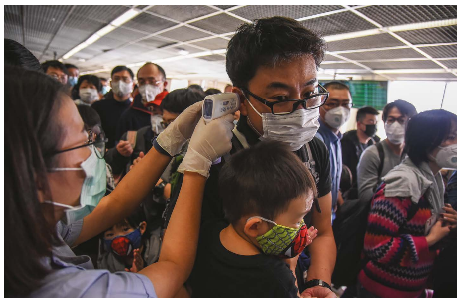
Public-health staff check the temperatures of people arriving from China at Bangkok airport.